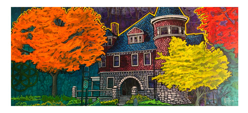
The Chaffee Art Center - YOUR Center for Creativity